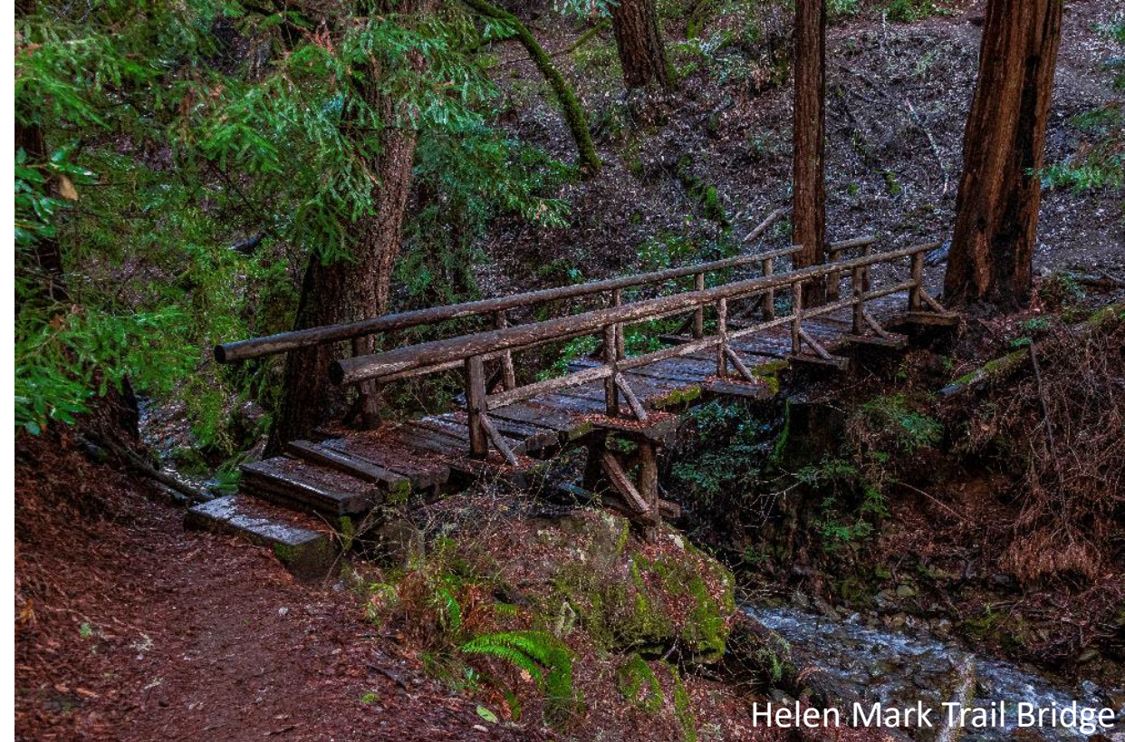
Helen Mark Trail Bridge