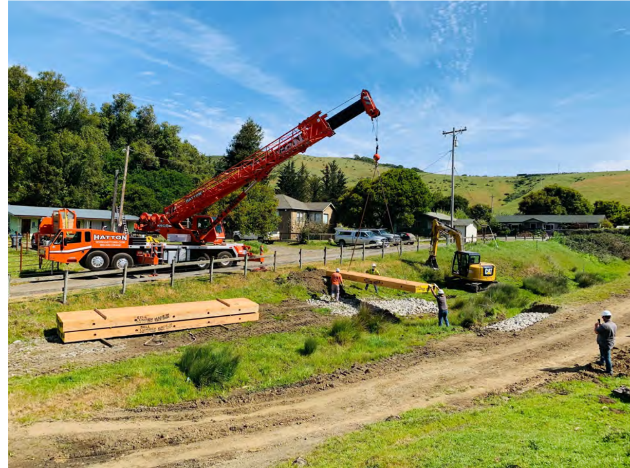
Cattle crossing bridge, April 2021