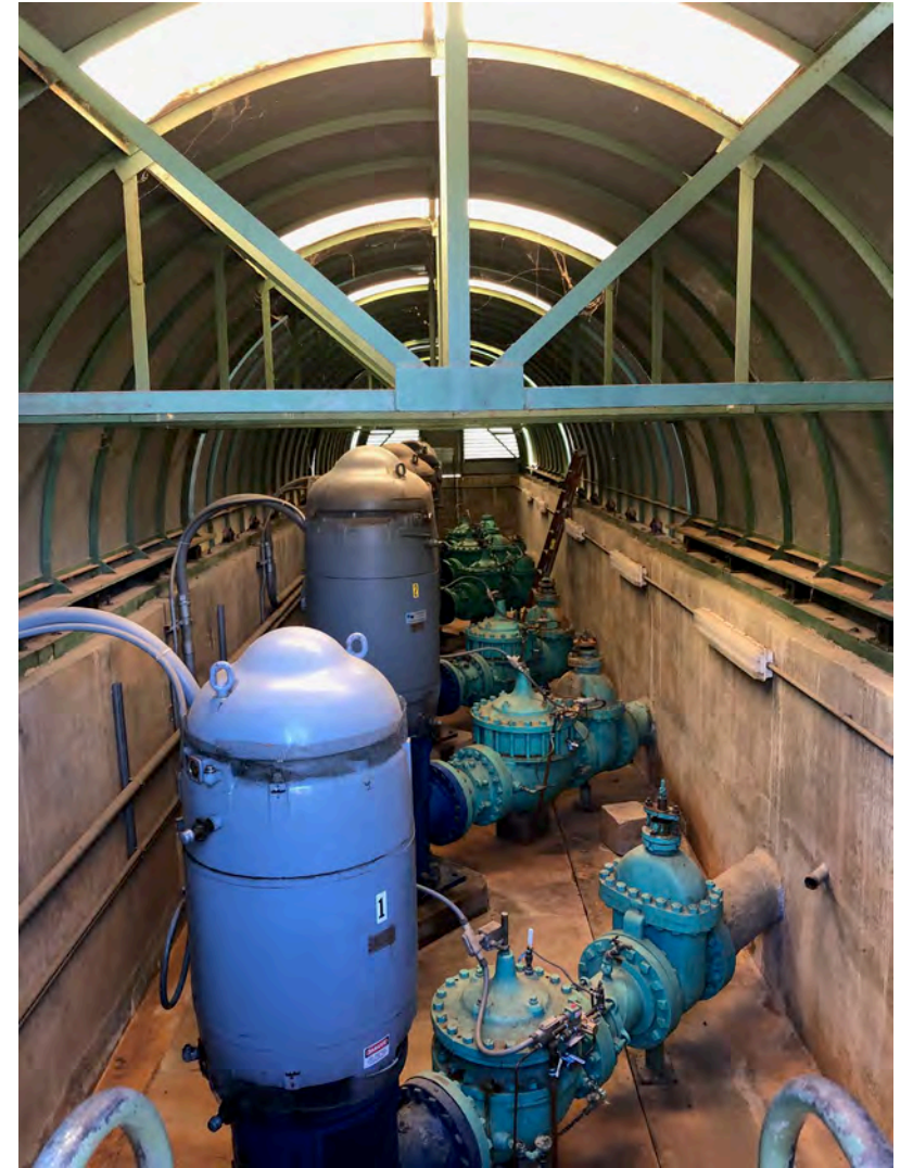
400 HP Motors and Pumps