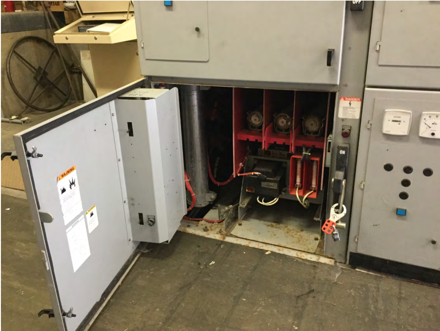
Pump #2 Motor Starter