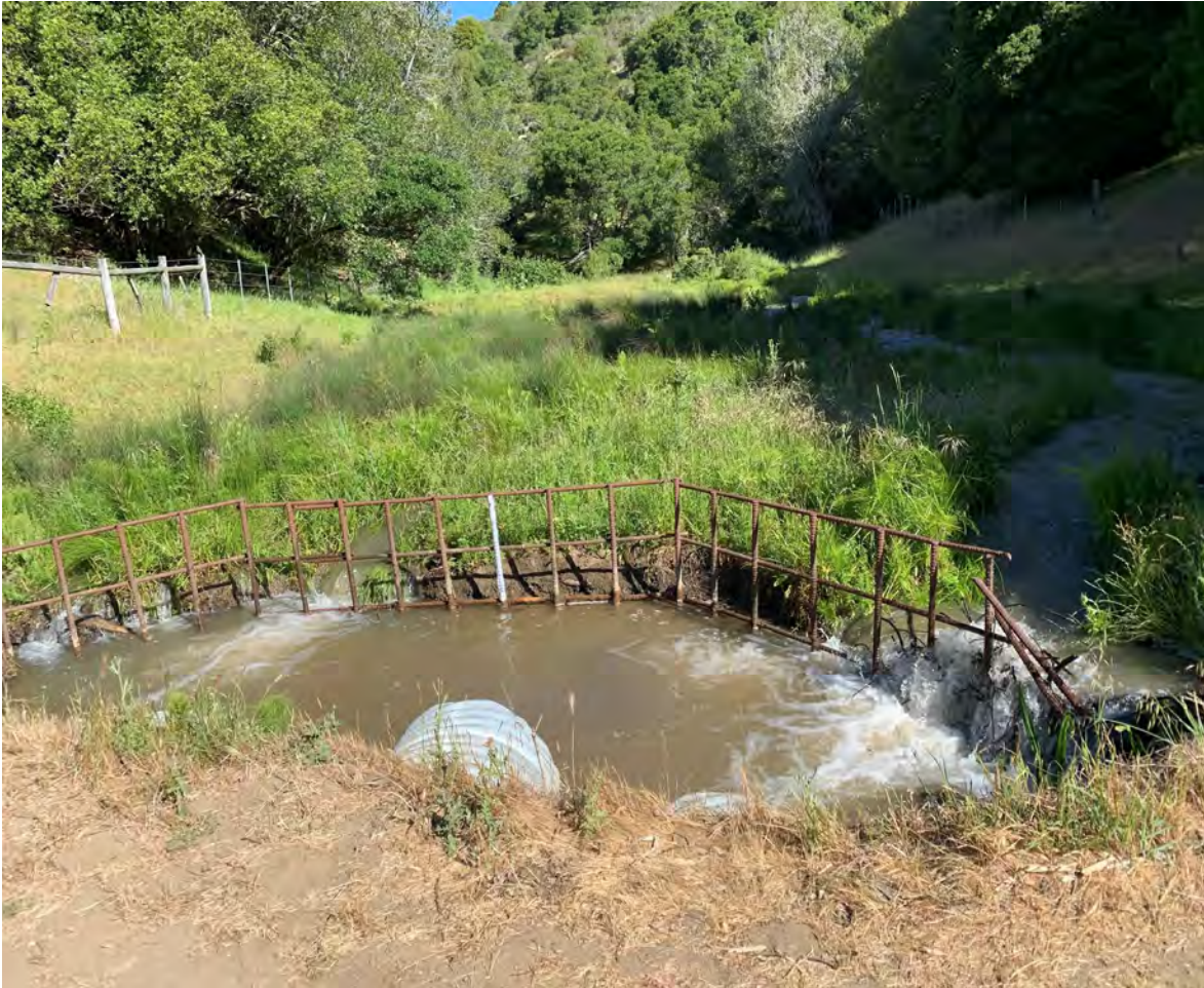
Discharge Point from Soulajule, May 2021