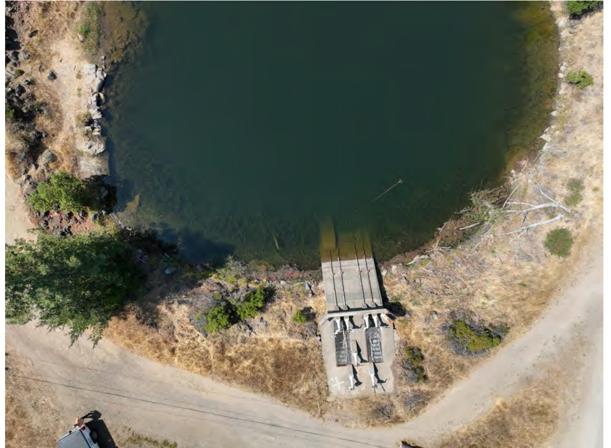
Bon Tempe Head Works