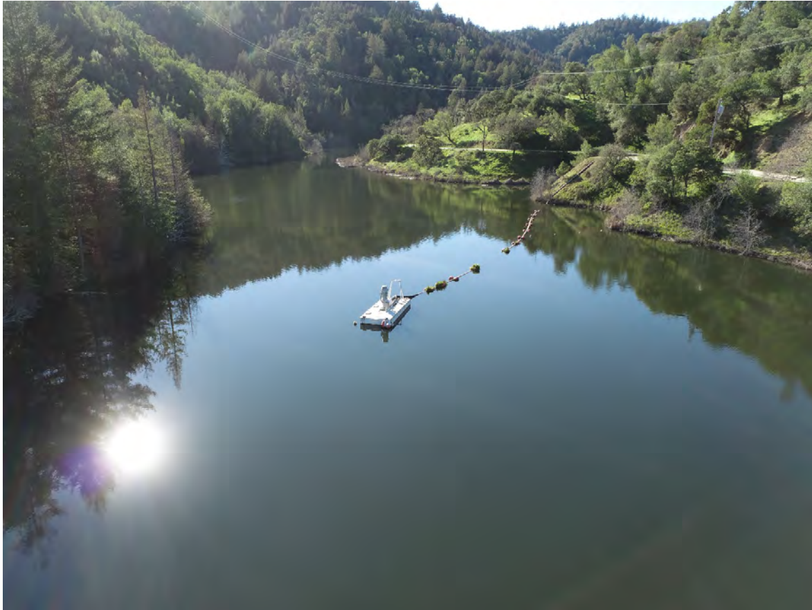
Phoenix Lake Barge Pump